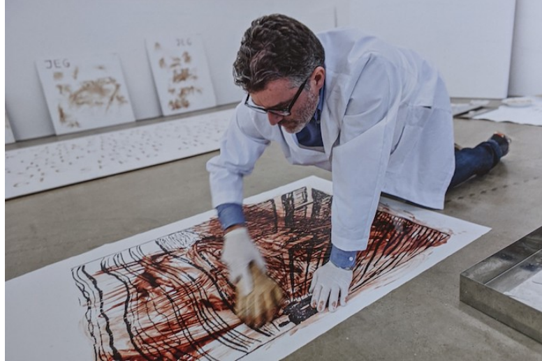
Figure 5 Morten Viskum, The Scream , 2015. Still from performance. Blood and silkscreen on canvas. © Morten Viskum.

Over the next few months we discussed many of Viskum's individual works. In the transcript I edited the questions I had asked at the time to include further references to art-historical works and some of my own comments. For example, in the first interview I pose the question, 'You specifically wanted a hand? Was that because in your mind as well you were thinking about the hand of the artist?' Viskum responds, laughing wryly,